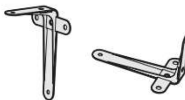
Stainless Steel Brackets